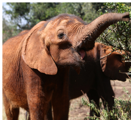
Get to know Tagwa: thedswt.org/tagwa