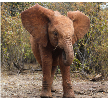
Get to know Rapa: thedswt.org/rapa